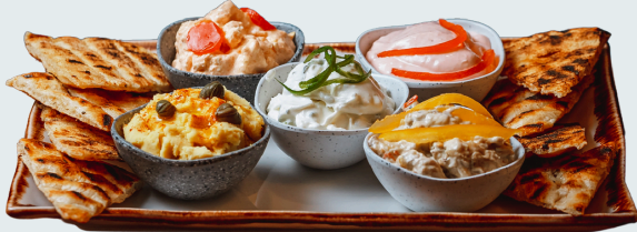
SELECTION OF DIPS £11.50