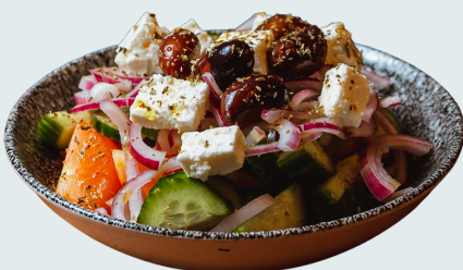
GREEK SALAD £11.50