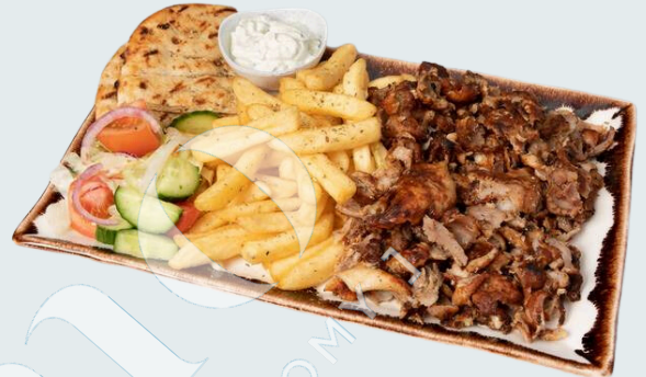
PORK YEEROS £18.70