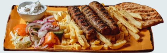
PORK SOUTZOUKAKI £18.50