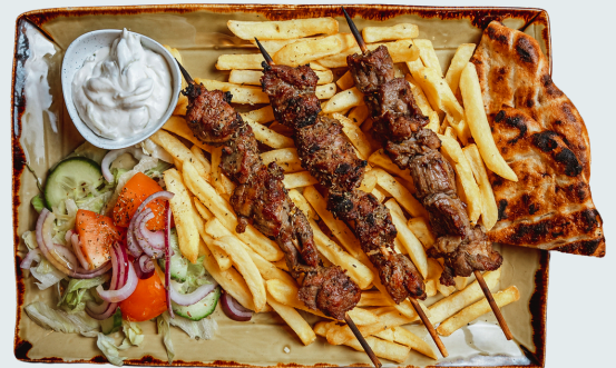
PORK SKEWERS £19.80