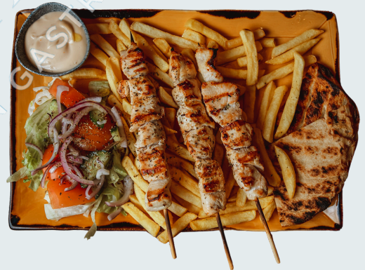
CHICKEN SKEWERS £19.80