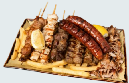
HERCULES MIX PLATTER £74.00