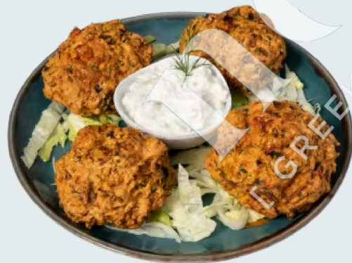
COURGETTE BALLS £11.00