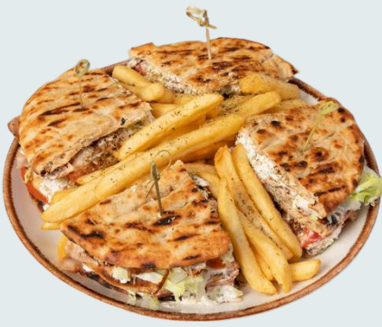
MAMMOTH PITTA CLUB £28.00